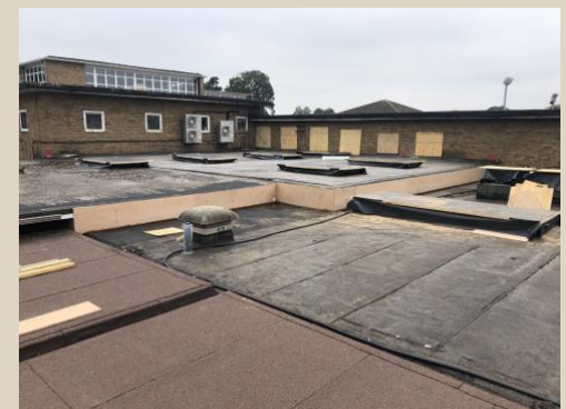
Prior to works being carried out