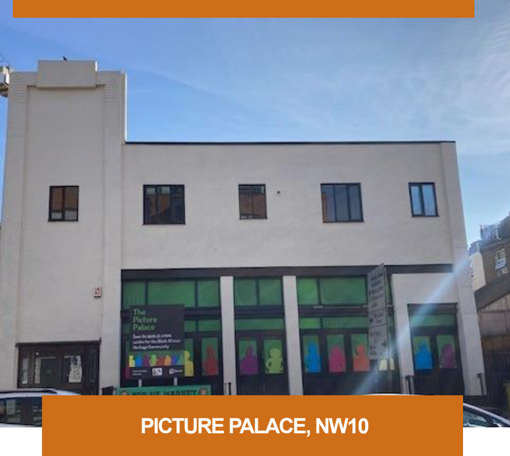
PICTURE PALACE, NW10